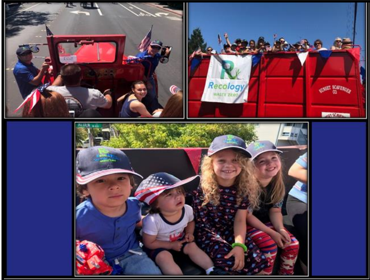
Recology employee-owners and their families celebrating Independence Day aboard Recology’s antique garbage truck, “Big Red”.

During Q3 2019, Recology San Mateo County (RSMC) participated in the 81 st Annual Independence Day Celebration in Redwood City. Employee owners and guests cheered on the crowd from “Big Red”, Recology Sunset Scavenger’s antique garbage truck, which was awarded 1 st Place in the Vehicle Category.