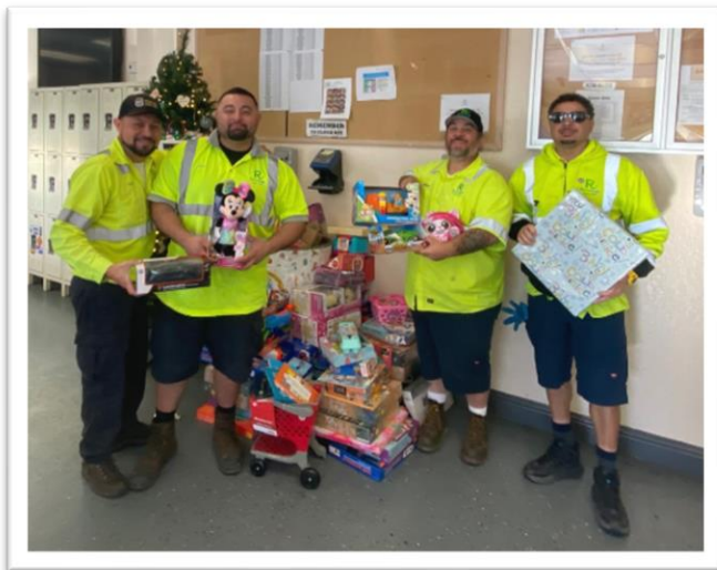
Recology drivers standing in front of an overflowing toy and book donation barrel located in Recology's dispatch.

Recology San Mateo County annually participates in the Redwood City / San Mateo County PAL Holiday Toy and Book Drive.