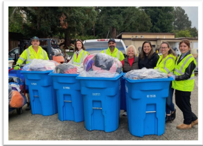
Recology Waste Zero along with Recology drivers and St Anthony's Donation Coordinator in front of bags of donated new and gently used coats for men, women, and children in need within the SBWMA service area.

Recology employee-owners, were warmed to once again collect, sort, and distribute over 350 coats and provided an extra holiday treat by serving donuts and hot chocolate to attendees of the coat distribution as they waited in line. The event promoted community connection and kept valuable resources in circulation, contributing to Recology's mission to create great resource eco-systems.