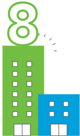
Table 4. Approved New Developments in Quarter 1 2024

Supporting State mandated recycling efforts to improve diversion, Recology Waste Zero advocates for building designs that facilitate ease and accessibility of resource recovery receptacles, while minimizing collection frequencies for environmental quality improvement and operational efficiencies.