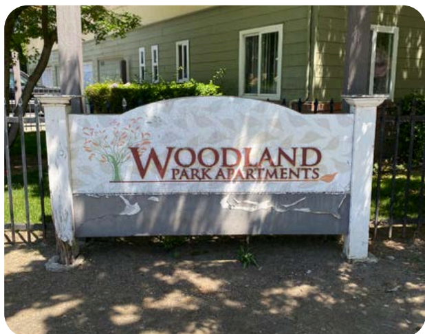
Woodland Park Properties, East Palo Alto

These changes required multiple meetings and site visits to adjust service levels to adequately meet the needs of the properties. Extensive coordination between Woodland Park Properties and Recology resulted in the delivery of 38 organics containers.