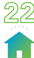
HOA Properties in Compliance