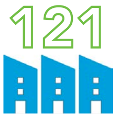
New Multi-Family Dwelling Organic Accounts

Homeowner Associations (HOA) within the Multi-Family Dwelling sector received targeted outreach, through phone calls, onsite meetings, and HOA Board presentations. In Q1, a total of 22 HOA complexes came into compliance, resulting in the distribution of 455 organics carts being delivered throughout the service area.