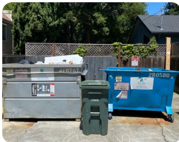
All three waste streams at Woodland Park Properties