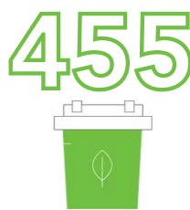
Organics Carts Delivered at HOAs