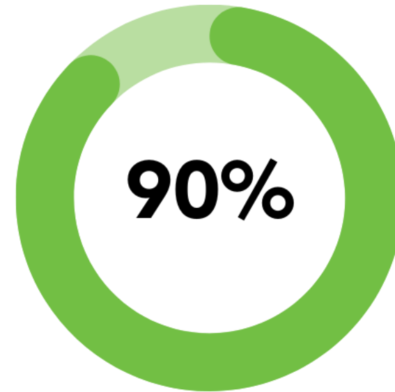
Multi-Family Dwellings 7% increase from Q3