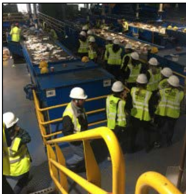
Environmental Day attendees touring the Materials Recovery Facility at the Shoreway Environmental Center.

"I recycle and do what I can already to reduce my carbon footprint but I had no idea how much more I CAN still do"