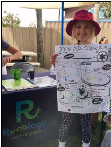
It's all smiles at the Marine Science Institute Earth Day event on April 22, 2017, where kids could illustrate their Earth Day ideas.

During Q2 2017, Recology San Mateo County (RSMC) continued the tradition of Earth Day outreach and education. RSMC participated in nine Community Events and provided nine Presentations for offices, private schools, and multi-family dwellings. Through these activities, RSMC's Waste Zero Specialists connected with over 1,000 customers in the SBWMA service area. RSMC's community outreach included educational sorting games, information for proper household hazardous waste and medicine disposal, and environmentally-friendly giveaways, such as gardening seeds and reusable grocery bags.