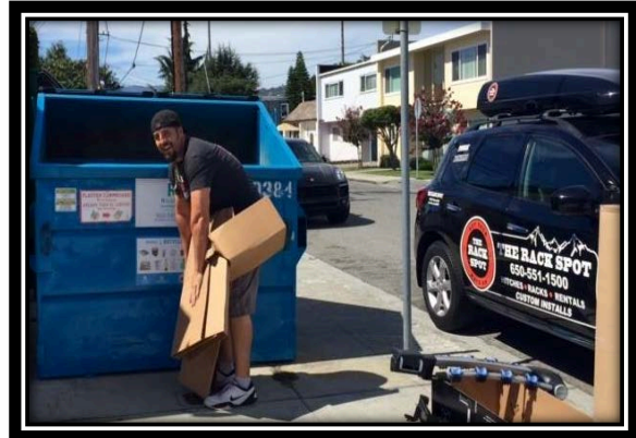
(The Rack Spot)