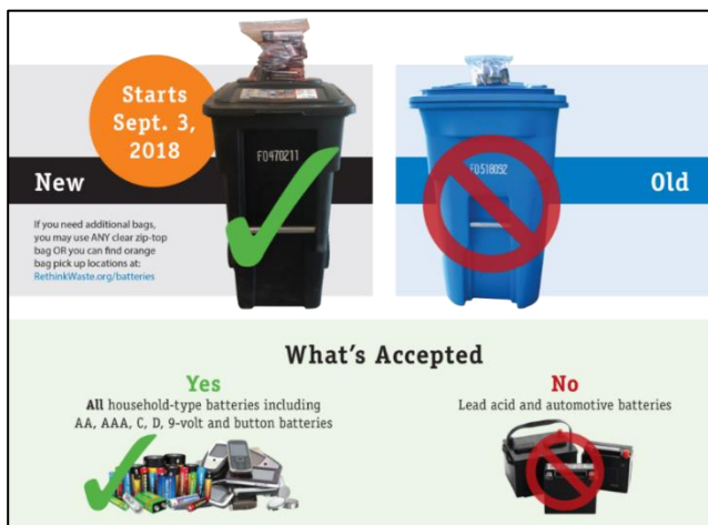
Household battery and cell phone program notice that was sent to all residents in RSMC's service area.

During Q3 2018, Recology San Mateo County (RSMC) partnered with RethinkWaste on the household battery and cell phone collection program relaunch. As a part of the program relaunch, RSMC converted collection from the residential recycle routes to the garbage routes. To support this route conversion, RSMC conducted trainings for all the recycle and garbage drivers to review the program changes. Battery boxes were also installed onto the garbage collection vehicles. The Waste Zero Specialists provided further education to property managers of multi-family dwellings (MFDs) on the program changes and delivered battery buckets and posters to MFDs, as requested. As a result of the program relaunch, the Materials Recovery Facility (MRF) has already described a steep increase in the total pounds collected throughout the SBWMA service area.