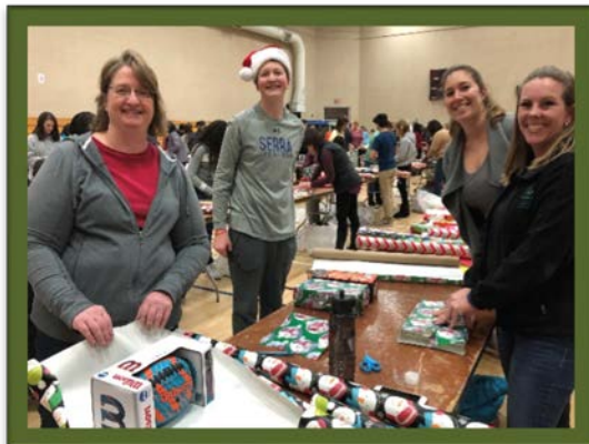
RSMC Employee-Owners and family help wrap gifts for the Annual Toy & Book Drive

On Tuesday, December 19 th , RSMC employee-owners and families volunteered their time at the Second Harvest Food Bank in San Carlos. RSMC employee-owners helped sort food donations into appropriate containers, which are provided to families in need throughout San Mateo County.