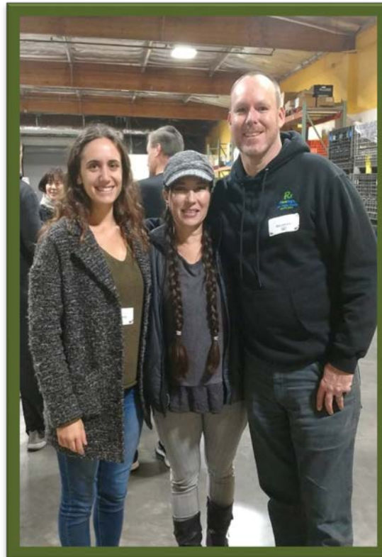
RSMC Employee-Owners and friends help out at our Annual Second Harvest Food Bank Volunteer Night